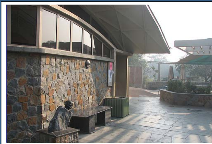
AIS/AES Alumni Spring 2010 Newsletter